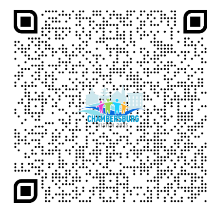
Chambersburg Vision 2035 Comprehensive Plan

Guy E. Shaul Community & Economic Development Specialist Borough of Chambersburg 100 South Second St., 2nd floor 717-251-2446 717-729-2262 cell gshaul@chambersburgpa.gov